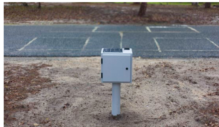
A low volume site with 5810 installed.