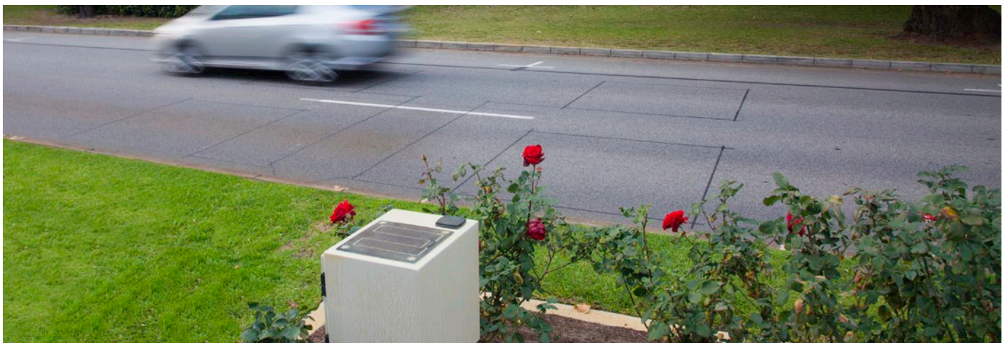
Two loops per lane with the 5810 model provide the City of Perth year round data on vehicle length, speed, and volume.

The RoadPod® VL can be extended to provide remote functionalities with the optional FieldPod® add-on. Through the mobile network, FieldPod® enables remote download, data checks and site diagnostics.