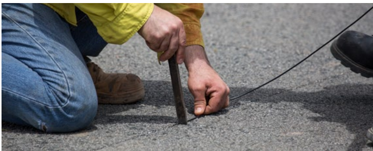
Installation of inductive loops to MetroCount spec.