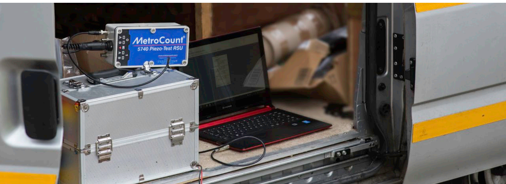
The MC Piezo Test is the world leading technology for characterizing and verifying piezo sensor installations.

diagnostics as well as record information from the piezo sensors post-installation, the MC Piezo Test provides detailed analysis of voltage offset, electrical noise, leakage and capacitance. This information is used to validate the installation and confirm the high degree of accuracy and compliance with contractual technical specifications.