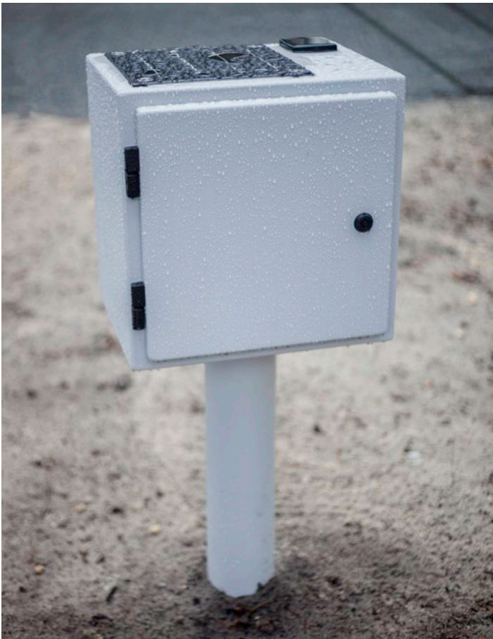
Weatherproof cabinet with 3G antenna and solar panel.