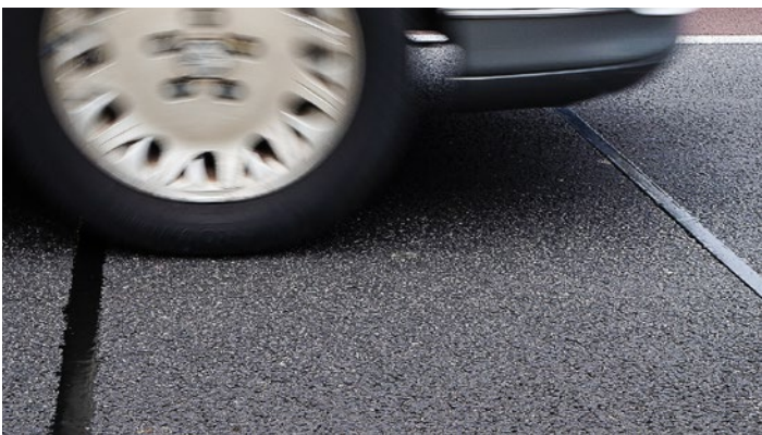
Low profile piezo sensors.